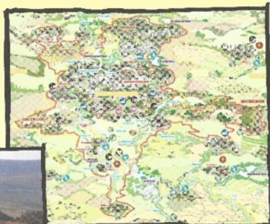
AREA OF SUPPLY