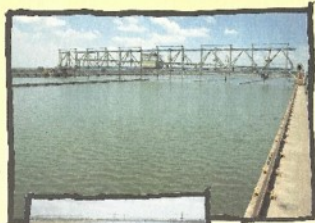
A SEDIMENTATION TANK WITH A DESLUDGING BRIDGE

This water flows slowly into large sedimentation tanks. The 'floc' then settles to the bottom of the tank to form 'sludge'. This is called sedimentation. The 'sludge' is sucked up by desludging bridges and sent to a sludge disposal site. The water in the top part of the tank is now cleaner. It flows over the side of the sedimentation tank into the clarification tank.