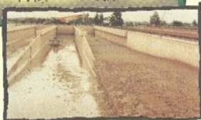
AN EMPTY SEDIMENTATION TANK