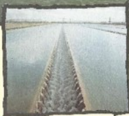
CLEAN WATER FLOWING OUT OF A SEDIMENTATION TANK