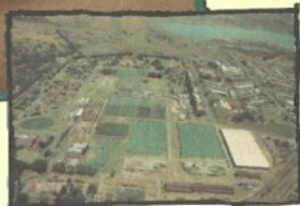
AN AERIAL VIEW OF A PURIFICATION STATION