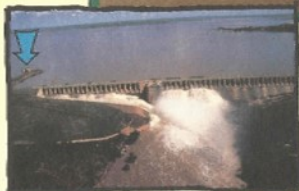
THE VAAL DAM, SHOWING THE INTAKE TOWER