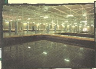
A FILTER HOUSE

The pH of the water has now been corrected through carbonation, but it still contains some small living organisms and germs. It flows into closed filter houses where it passes through sand filters. These are big, flat beds made up of different sized particles of sand and stone. As the water flows slowly through these filters all the small living organisms and some germs are trapped. The water now enters underground pipes.