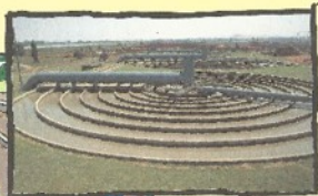
A SPIRAL FLOCCULATOR