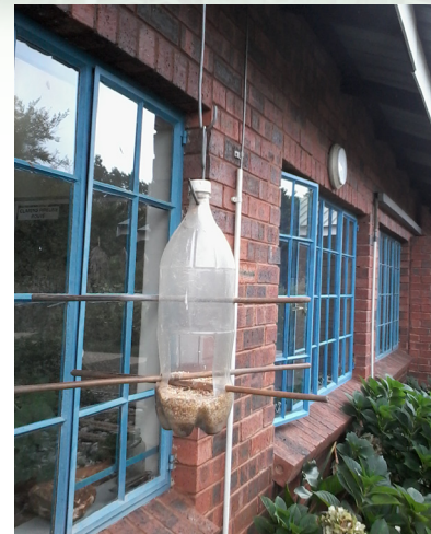
Fig 2. A creative bird feeder made from one 2-litre plastic bottle.