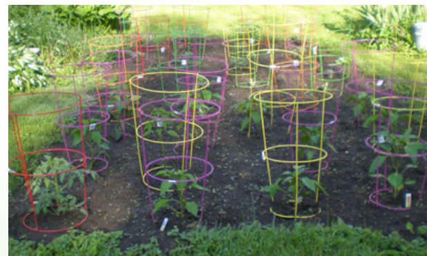
Fig 3. Brightly coloured wire plant supports add a splash of colour to this vegetables garden.

Many perennials – for example, alstroemerias – have a floppy growth habit and need to be supported to keep them upright. It is easy to make a framework to support them out of coat hanger wire. A four-legged support can be wrapped around the plant and then linked together (Fig 3). Use coat hanger wire to make two circular pieces 1 m in length long and the four legs 70 cm in height. Peg the legs into the ground around the plant and wrap the longer pieces of wire around the legs to keep the supports together. Use thin wire pieces to attached the circular wire pieces to the legs. You can also make taller and narrower supports for tomatoes.