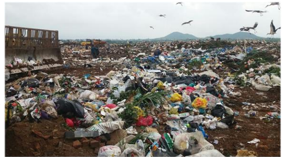
A rubbish dump in Pretoria

In order to make sure that the best quality water is possible from within our catchments, let us all follow some simple guidelines: