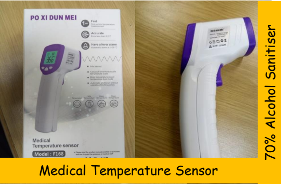
Medical Temperature Sensor

The following were amongst the measures: a special room for screening; protective clothing; surgical gloves; medical temperature sensors; face shields; sanitizers (70% alcohol); colour coded stickers; and separate recording lists for Rand Water employees and visitors. Anyone entering the premises each person has to register themselves, be sanitized, screened, complete the COVID-19 screening form, have their temperature recorded, be asked about any symptoms and once cleared they get a sticker and be allowed to go to their intended venue/place of work. The process continues daily.