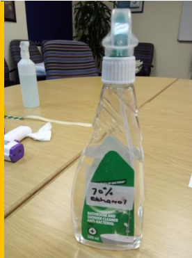
70% Alcohol Sanitiser