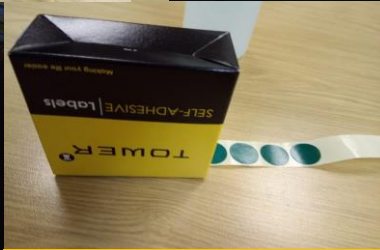
Colour Coded Sticker

The success of the screening is evident. In the process, the employees and visitors are cooperative, displaying respect and commitment to have the virus controlled at all costs. Working together can help minimise the spread of this invisible enemy. Rand Water staff cannot be compromised as this is a time where water is needed the most for sanitation purposes.